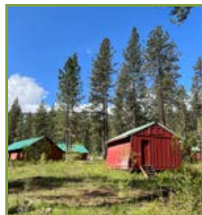
Blue Mt. 4-H Center Cabins

Last May students from Elgin were at Outdoor School at the Blue Mountain 4-H Center north of LaGrande. I was there to learn about a citizen science project I wrote about in the summer edition of this postcard. But it was a side conversation that reminded me of an important element of many Outdoor School programs: kids learn to help, and that is empowering.