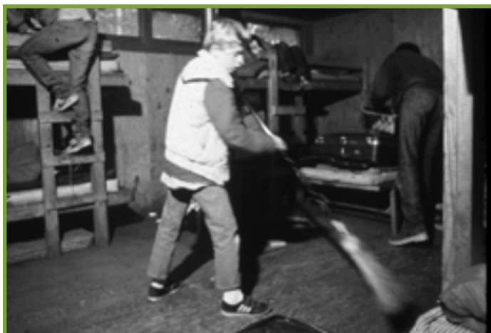
Cabin Clean Up, 1980s

I remember one particularly frigid week of Outdoor School at Camp Namanu when the temperature barely got into the low thirties. The cabins had fireplaces and woodstoves, so we asked the kids to haul firewood to keep the cabins comfortable. The job quickly changed from being a chore to being a chance to help friends stay warm. Soon kids were reminding their leaders that they needed to swing by the woodshed on their way back to the cabin to make sure nobody was too cold.