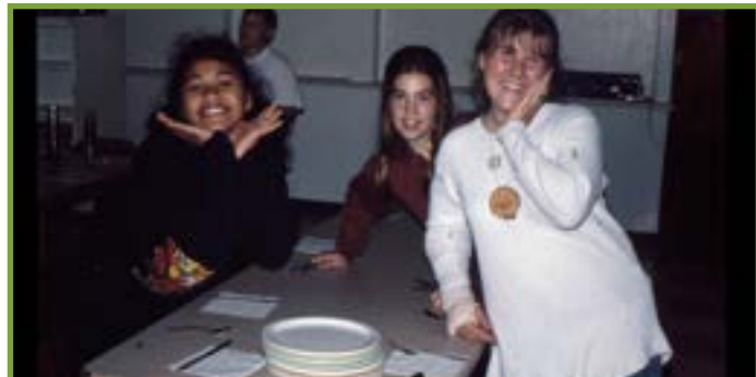
Setting Tables, 1990s

Over the 65 years of Oregon Outdoor School, students have set tables, cleaned bathrooms, swept their cabins, and cleared dishes. Often these jobs have been regarded as chores nobody relishes, but when the importance of the work becomes apparent students feel good about contributing.