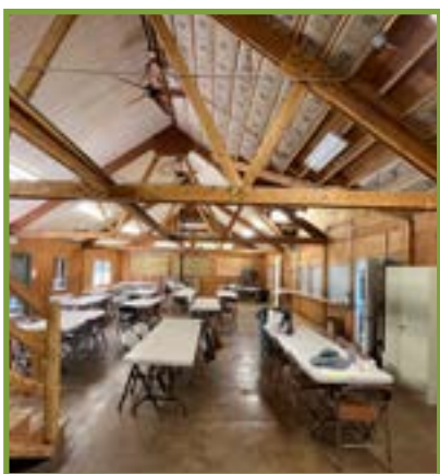
Blue Mt. 4-H Center Dining Hall

Last May students from Elgin were at Outdoor School at the Blue Mountain 4-H Center north of LaGrande. I was there to learn about a citizen science project I wrote about in the summer edition of this postcard. But it was a side conversation that reminded me of an important element of many Outdoor School programs: kids learn to help, and that is empowering.