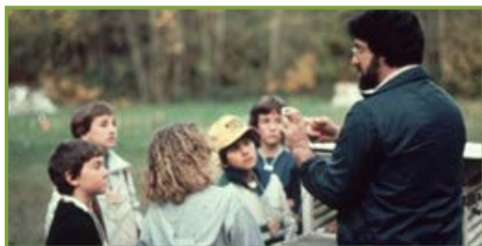
Weather Crew, 1980s